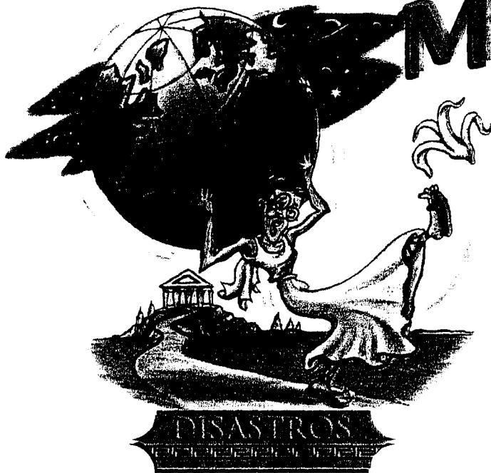
DISASTROS GODDESS OF KLUTZES

You may have heard about the famous gods of the ancient Greeks, like Apollo and Athena. But you'll never hear about the ones that Zeus, ruler of the gods, booted out of Mount Olympus. (Until now.)