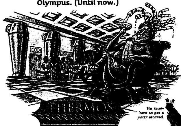
THERMOS GOD OF THIRSTY PEOPLE

Rejected because: Atlas, a god who held up the world and the heavens, asked Disastros to hold them for five minutes. She did okay for a few seconds but then dropped them, so Zeus gave her her walking papers—which she accidentally dropped as well.